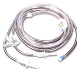
Tube set for Irrigation, disposable (T0505-01)

Power supply cord and further accessories available upon request.