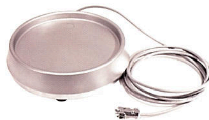
Differential volume scale (Z0223-01)