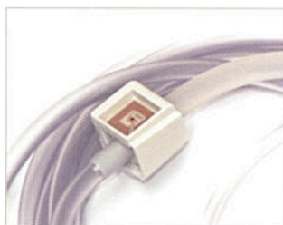
An original LEMKE tube set with transponder protection.

The Pump can be used with up to four indications. Each indication can be unlocked individually as well as combined with one another. The automatic instrument recognition optimally adjusts the Pump to the instrument to be used. A transponder in the tube ensures the highest level of patient safety and maximizes pump output. The device is also equipped with a vacuum pump for suction, a 5.7" touch screen display, and an optional foot switch. The Pump is designed for more than 15 languages.