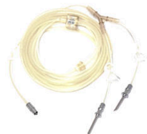
Tube set for Irrigation, reusable, 20 uses (T0506-01)